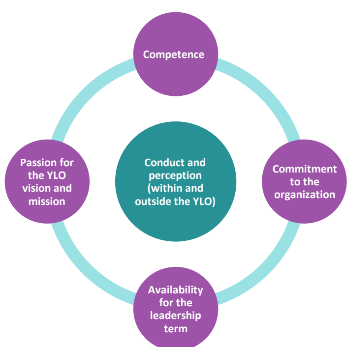
FIGURE 2: ILLUSTRATIVE QUALITIES OF AN INCOMING YLO LEADER

In this step, the YLO leadership and leadership succession committee identify strong performers within the organization based on essential leadership qualities, hard work, and demonstrated dedication (outlined in Figure 2). Additionally, staff appraisal information can be incorporated to identify the leader.