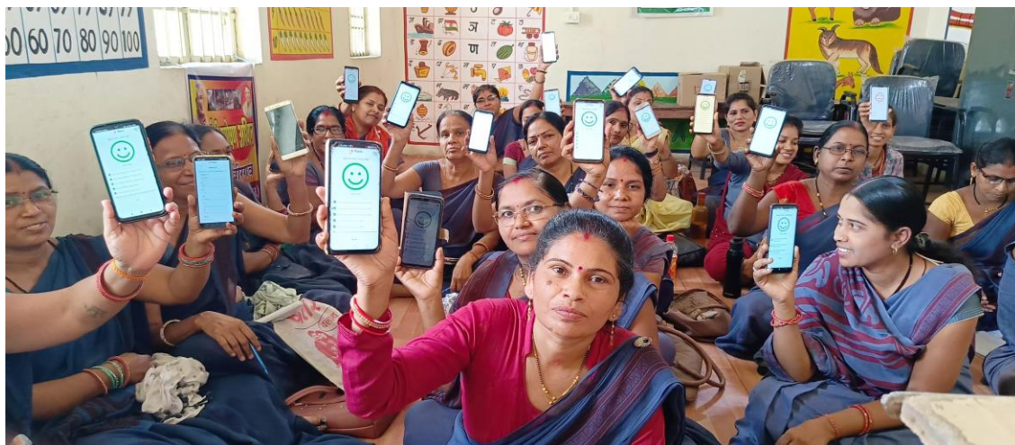
Training of CHWs on MANSI Application in Durg, Chhattisgarh on May 20, 2023.

Following development of the application, the project-oriented community health workers on how to use the application. The application has been downloaded by almost 15,000 community workers.