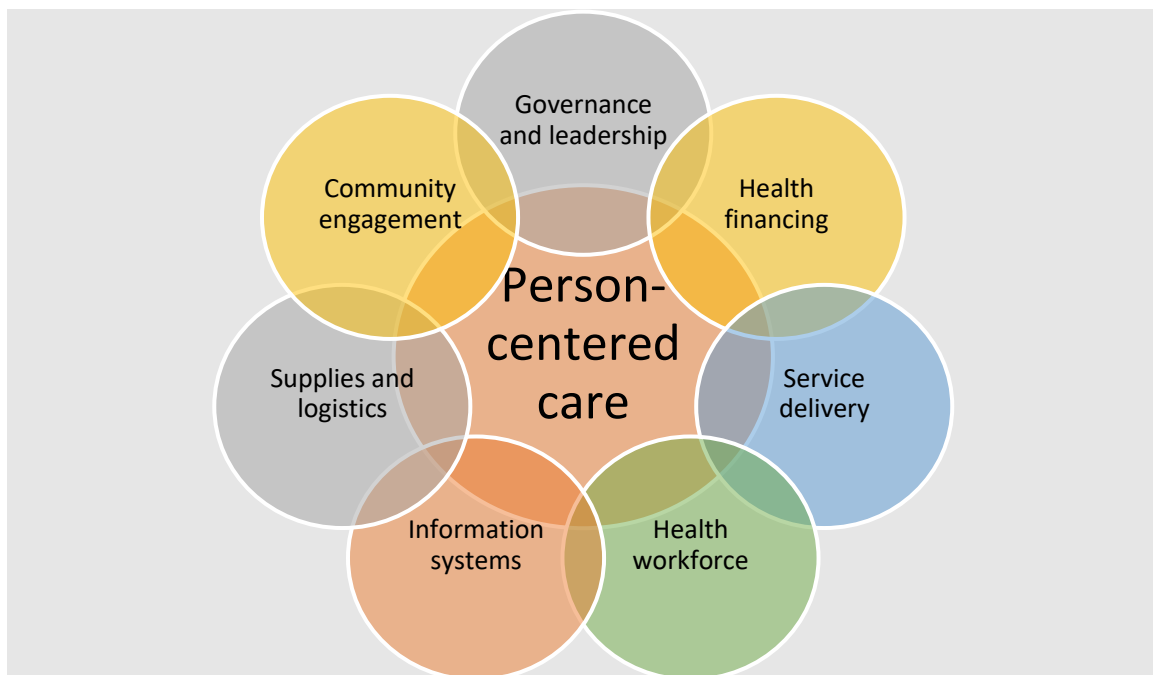
FIGURE 3: HEALTH SYSTEM BUILDING BLOCKS

Modified from the WHO Health Systems Framework