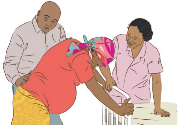
Figure 1: Labour support

Source: HMS/Laerdal. Prolonged and Obstructed Labour