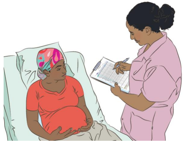
Figure 2: Assessment in Labour

The modified partograph (or partogram), formerly recommended by the WHO, is the most common labour monitoring tool used during the active phase of labour. If the partograph is currently in use, replacing the partograph with the WHO LCG will require considerable health systems commitments to ensure an enabling environment and its consistent use. Maternal and newborn health stakeholders and decision-makers must therefore understand the LCG's advantages over use of the WHO modified partograph, and that its use should support implementation of the new WHO intrapartum care recommendations and lead to better experiences of care and outcomes.